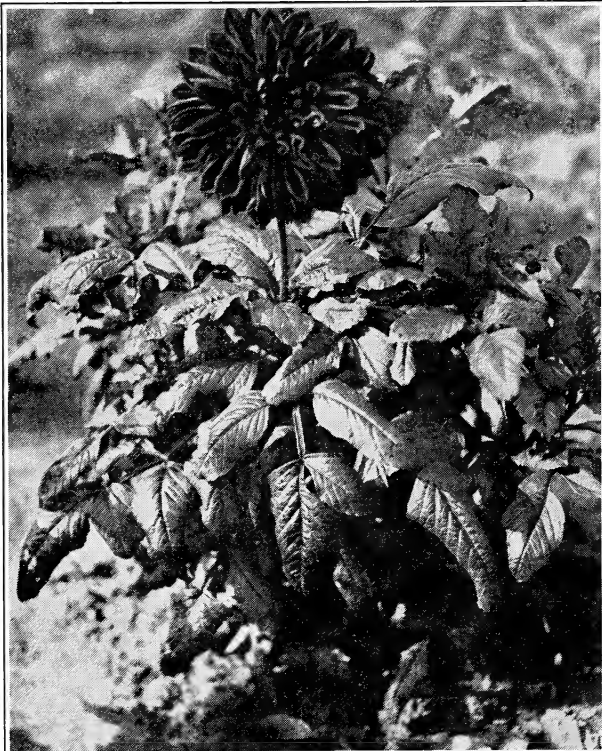
THOMAS A. EDISON F. D. (Dahliadel)—Royal Purple named for the famous Electrical Wizard with his approval. Staghorn petal formation insect resistant foliage, cane stiff stems, thrifty growing habits, is the report on this new 1930 Dahlia from high sources. Has grown in our gardens since 1931. Our available stock limited. $5.00 each, Plants, $2.50.

We appreciate your patronage in values not words. Note this. Upon receipt of your 1932 order from this catalog we will forward you a coupon for 10% of the value of the 1932 order good for that amount on an order of equal amount or more in 1933 or for 10% of the amount if 1933 order is less. For instance, if your 1932 order is for $7.50 we will send you a coupon good for 75c on an order of $7.50 or more in 1933 or for 10% of any 1933 order less than $7.50, and so on. We make this unusual offer to our customers as our appreciation for their support which has assisted our success. We want you to take advantage of it.